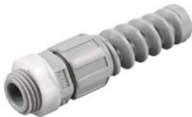
Gray Cord Connector with Spiral