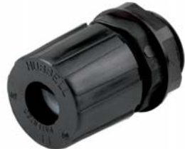
Black Cord Connector